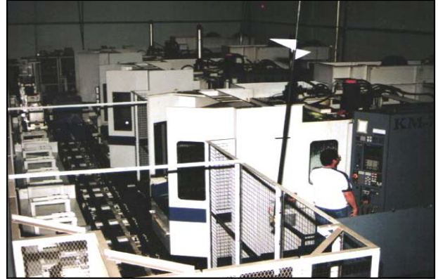
Machining Centers: High speed pull systems